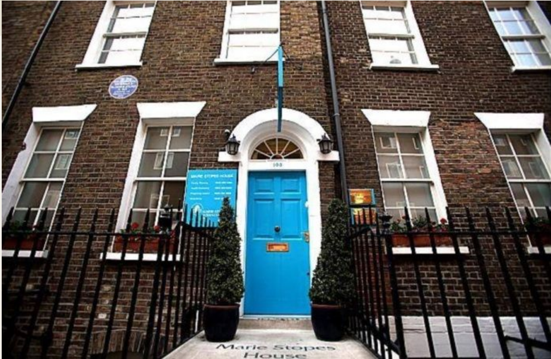
Marie Stopes House